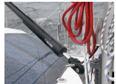
Hydraulic boom vang (HV)