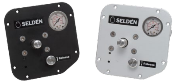
Control panel, 1-function