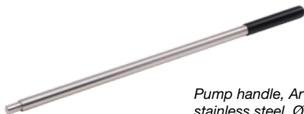
Pump handle, Art. No. 587-101 stainless steel, Ø20 x 500 mm