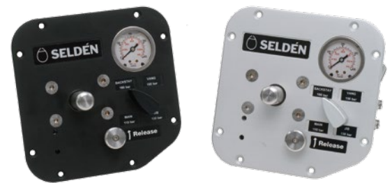
Control panel, 4-function