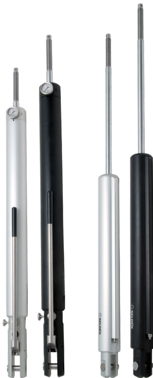
Hydraulic Tensioners Integral (HTI)