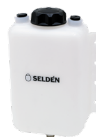
Oil reservoir, Art. No. 585-300-01