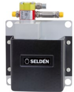
Electric pump, Art. No. 587-800-01